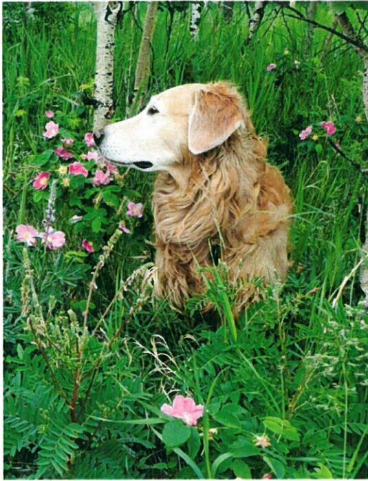
Mitch - Stop and smell the flowers